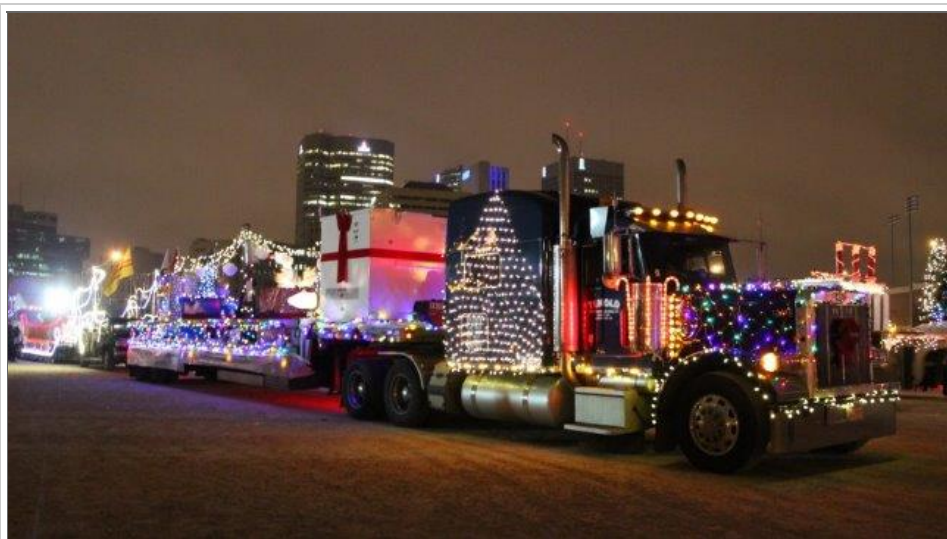
The Carte International float passes the city skyline.

Asked about the reasons for having a float in this parade, most responded that they were there to create awareness in support of various non-profit organizations.