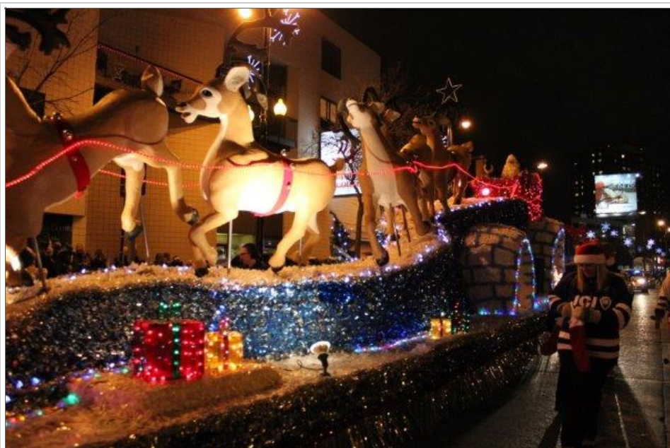
Santa Claus and his float; the main attraction at the parade

Posted in Arts & Entertainment, Charitable Organizations, Our City, Our Neighbourhoods, Stories of Giving