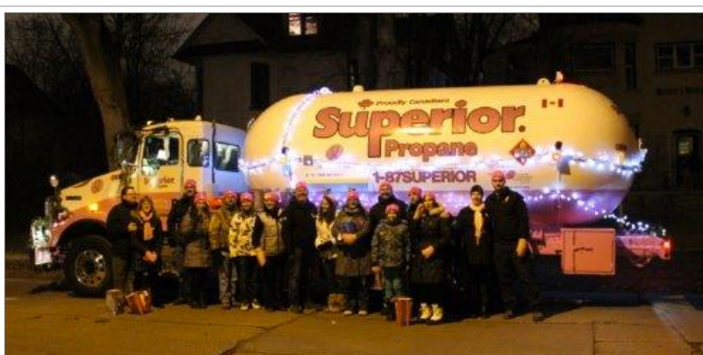
Superior Propane float in support of breast cancer research.

Twenty of Savoie's staff were there in support of breast cancer. All year long a portion of revenue pumped out of each litre of propane goes to breast cancer research.