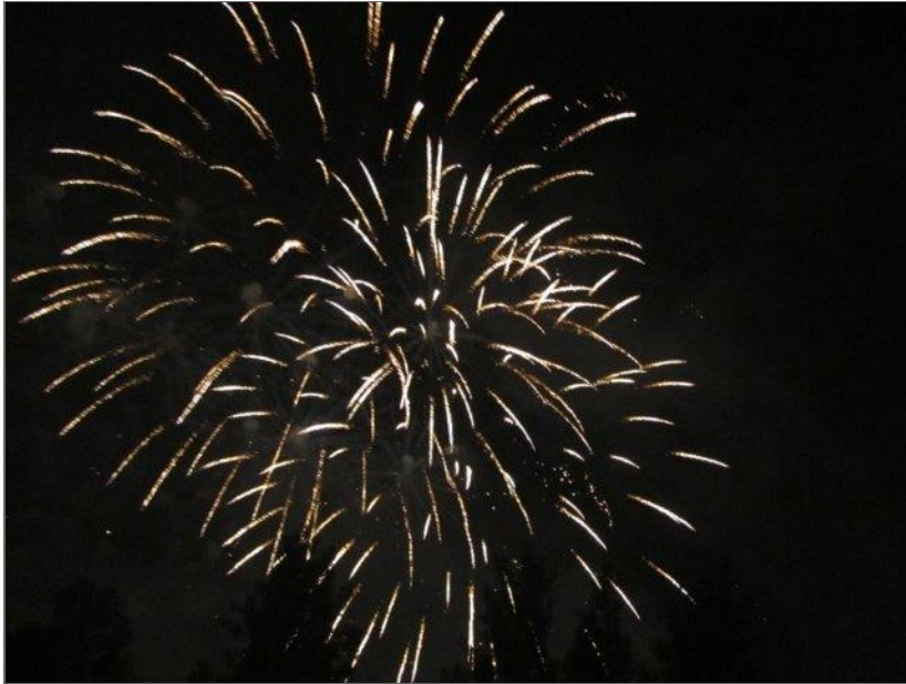
Fireworks at The Forks were a fitting conclusion to the parade.