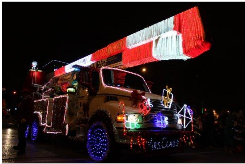
Mrs. Claus in the crane bucket of Urban Forestry float.