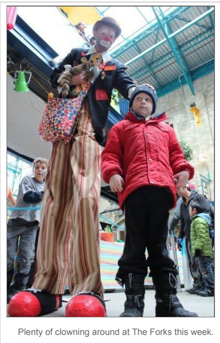
Plenty of clowning around at The Forks this week.

try out the swinging trapeze workshops (Saturday and Sunday). Register early at The General Store / Information Table for workshops. Refer to this link for schedule of events and performers .