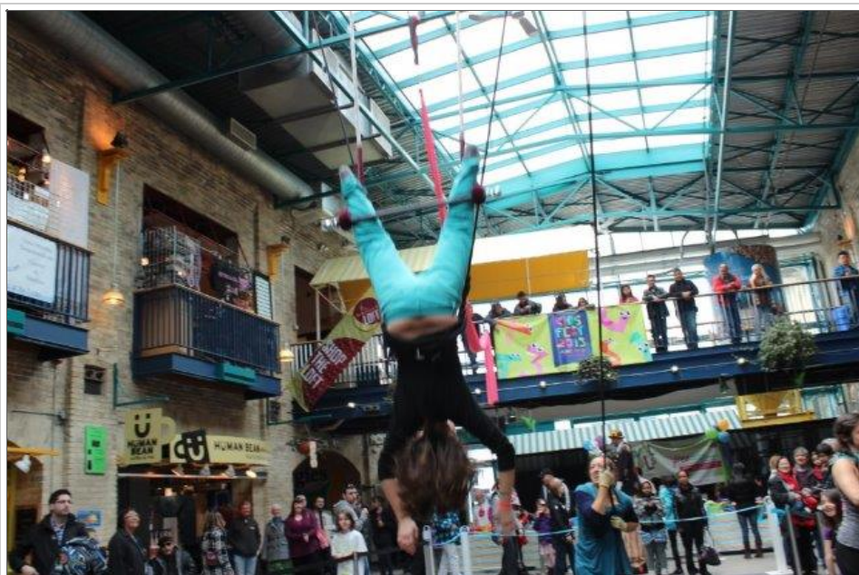
Trying out the trapeze at The Forks during Festival of Fools.

Posted in Arts & Entertainment, Charitable Organizations, Culture, Downtown, Education