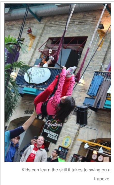
Kids can learn the skill it takes to swing on a trapeze.