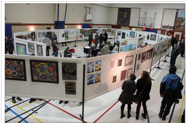
Art From The Heart Show and Sale will be held on Feb. 13 and 14

Posted in Arts & Entertainment, Culture, Downtown, Our Neighbourhoods