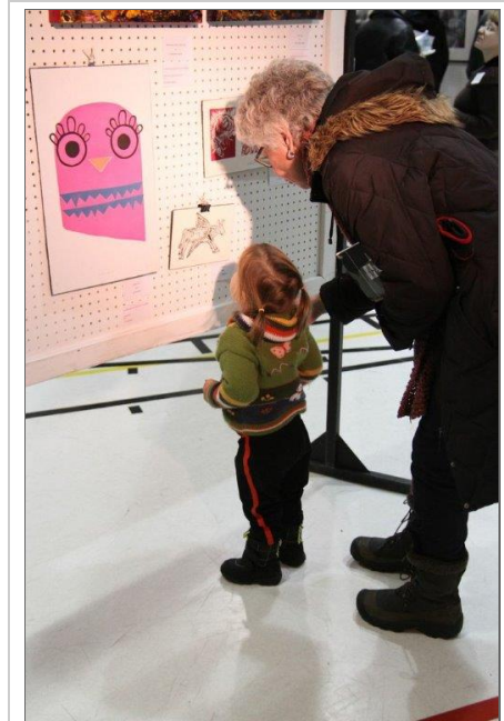
There's art for everyone.

Happy Valentine's Day to all. Let your love shine from your heart to the lives of everyone in your life and all you meet. Give the gift of art to yourself and others all year long.