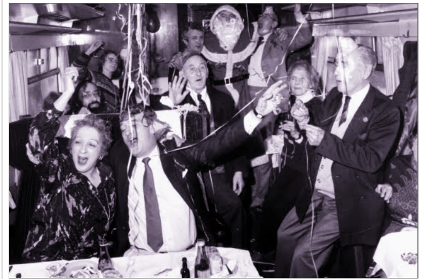
Members Show & Holiday Carnival from Martha Street Studio should be plenty of fun.

Give from your heART and have a great time celebrating as you join in the fun at this fantastical whimsical carnival.